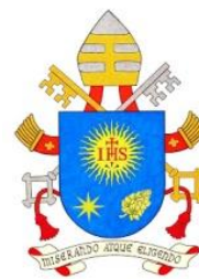
Pope Francis Vatican City State